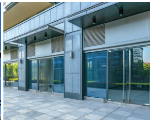
Retail & commercial