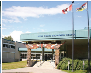
Schools & educational facilities