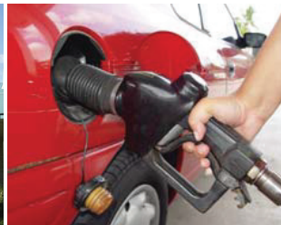
Service stations, including gas stations & automotive repair shops