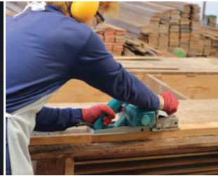
Manufacturers, woodworking shops & spray operations