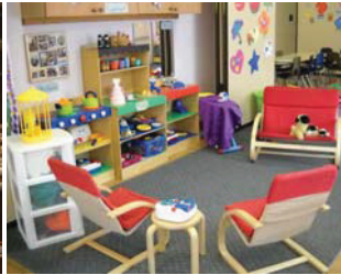
Daycares & preschools